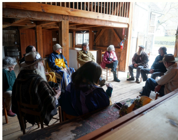
GSSS SHAKER VILLAGE AT CANTERBURY, NH